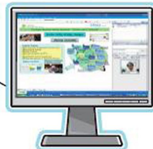
Web communication, e-learning